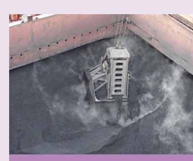
Coal being loaded. Coal is most commonly a Group B cargo, but can also be classed as both A and B.

Coal (bituminous and anthracite) is a natural, solid, combustible material consisting of amorphous carbon and hydrocarbons. It is best known as a Group B cargo due to its flammable and self-heating properties, but it can also be classed as Group A because it can liquefy if predominantly fine (i.e., if 75% is made up of particles less than 5mm in size). In these cases, it is classed as both Group A and B.