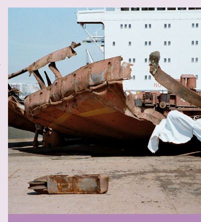
The damage caused by a DRI explosion

Ammonium nitrate-based fertilisers support combustion. If heated, contaminated or closely confined, they can explode or decompose to release toxic fumes and gases.