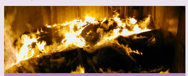
DRI which has self heated

Corrosion can be caused by some Group B cargoes and their residues. A coating or barrier may need to be applied to the cargo space structures before loading. Before loading and unloading corrosive cargoes, make sure the cargo space is clean and dry.